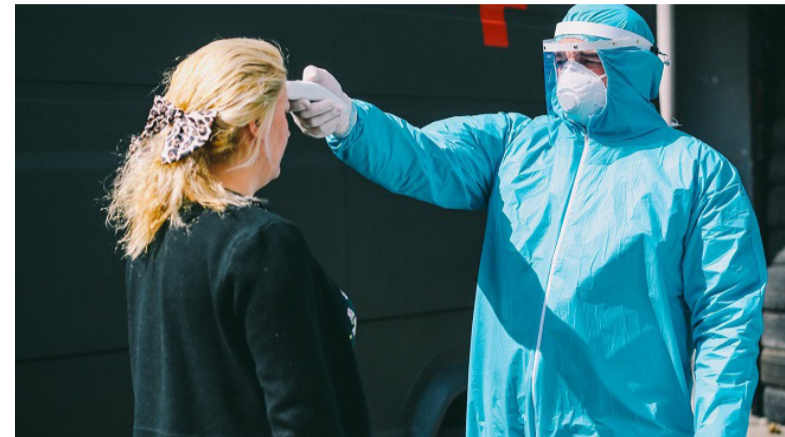
► There were total of 235,491 cases of Covid-19 reported in Georgia.