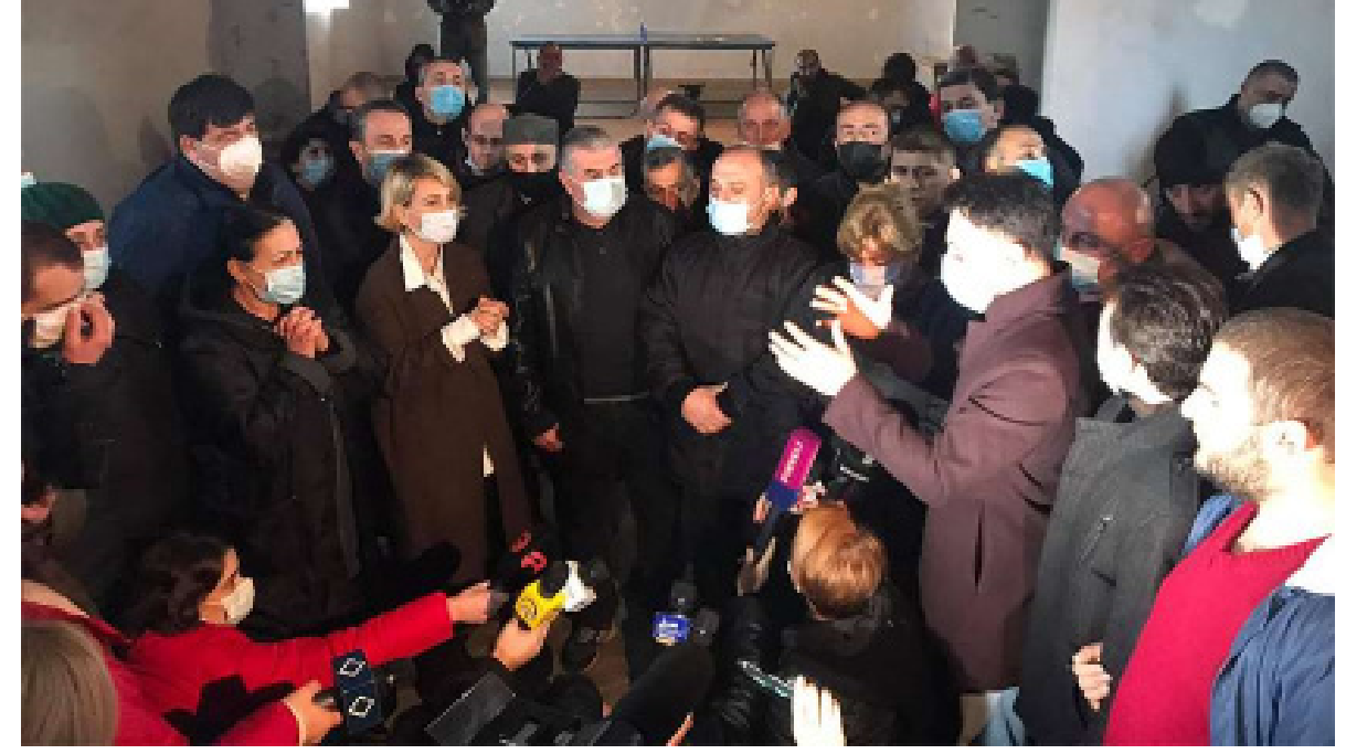
The signatory organizations respond to the recent developments in the village of Buknari.