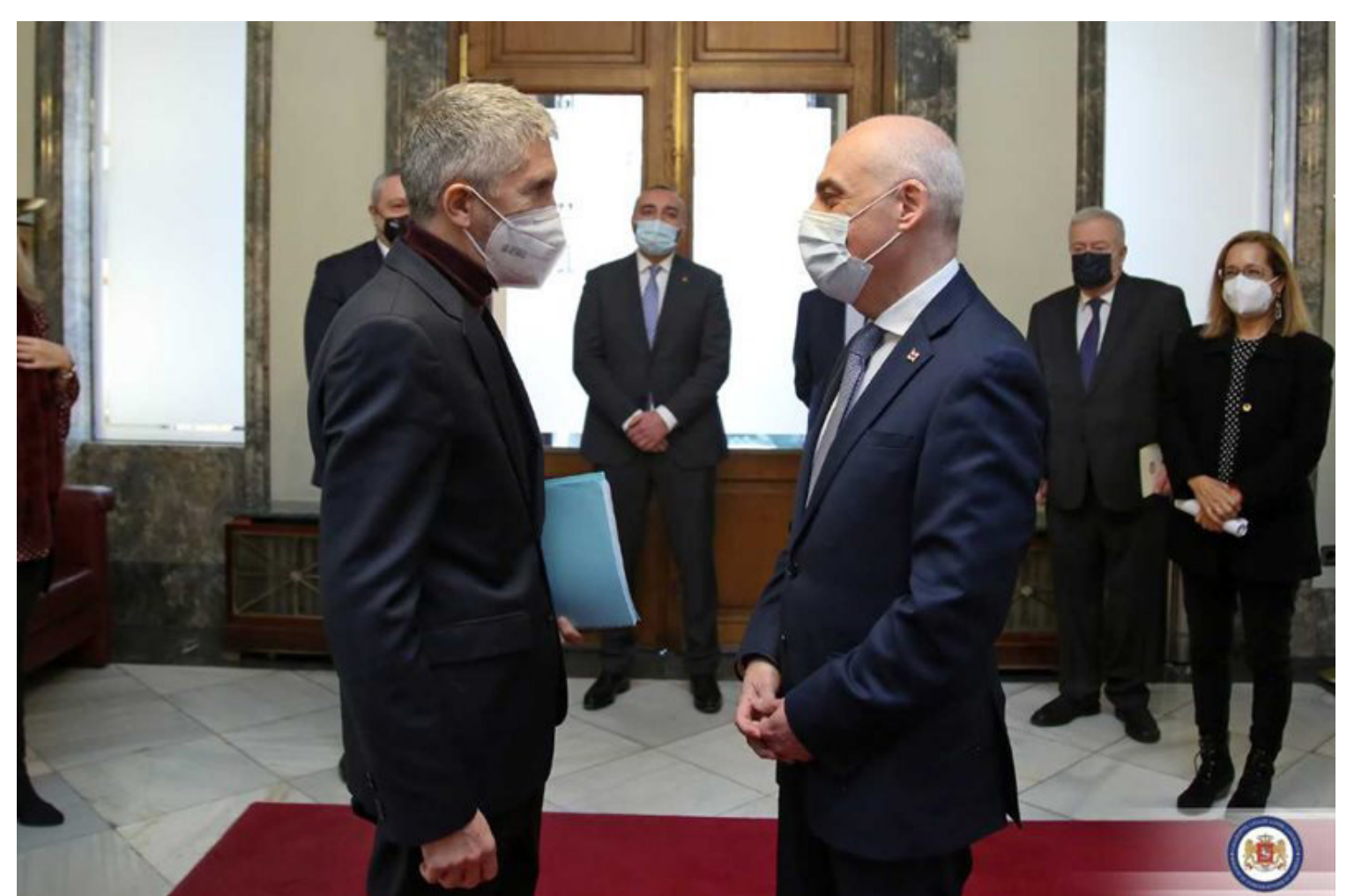
Spanish Interior Minister Fernando Grande-Marlaska and Georgian Foreign Minister David Zalkaliani.

Zalkaliani also met with the interior minister of the Kingdom of Spain. The meeting mainly focused on the global pandemic and its management process. Apart from that, the sides highlighted the successful cooperation between Georgia and Spain in the field of law enforcement and discussed the steps taken by the Government of Georgia to enforce visa-free travel. The parties expressed readiness to facilitate the signing of a readmission agreement between Georgia and Spain and discussed the prospects of Georgian driving license recognition in Spain. In this regard, the reforms carried out by the Ministry of Foreign Affairs of Georgia is noteworthy, according to which, Georgian driving licenses fully comply with EU standards.