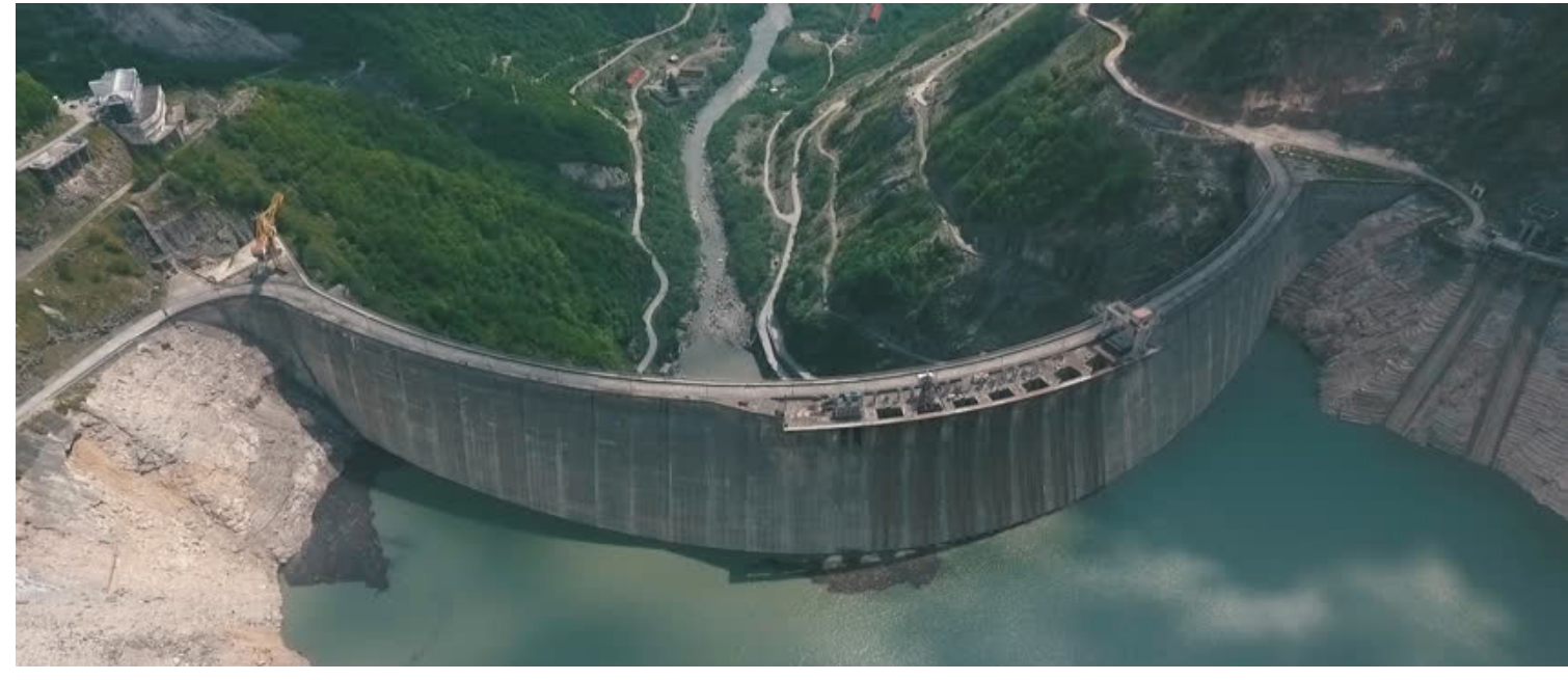
Enguri hydroelectric power plant was first opened in 1987 and is the largest electricity producer in Georgia.

According to the Minister of Economy and Sustainable Development of Georgia Natia Turnava, while the dam is closed, the occupied region of Abkhazia will receive imported electricity from Russia and the Georgian side will not participate in this process.