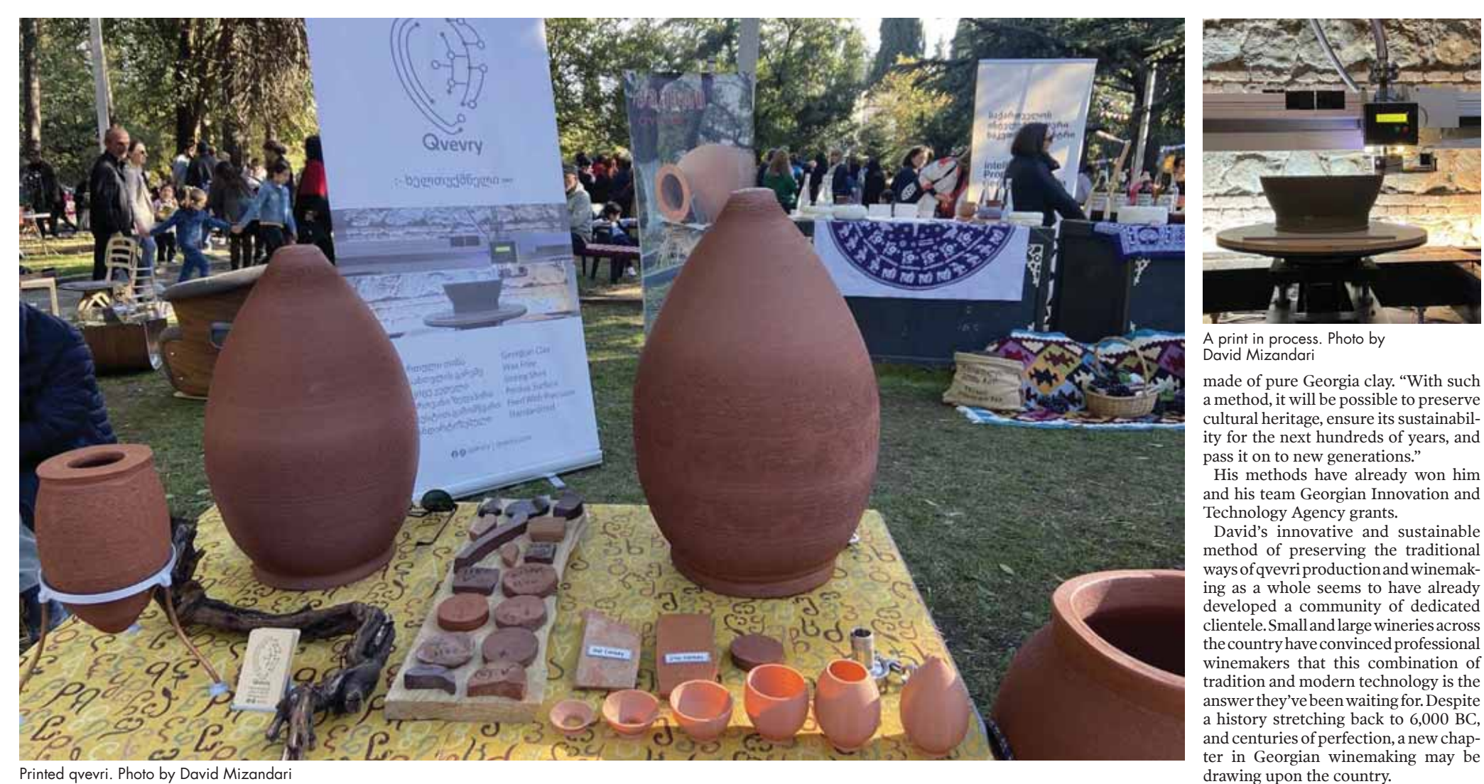
Printed qvevri.