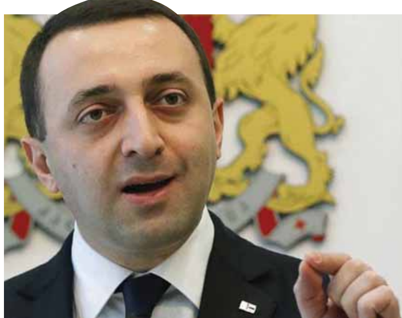
Georgian Prime Minister Irakli Garibashvili.

Most notably, Former Prime Minister and leader of the party "For Georgia" Giorgi Gakharia posted to social media succinctly, saying "we're witnessing a