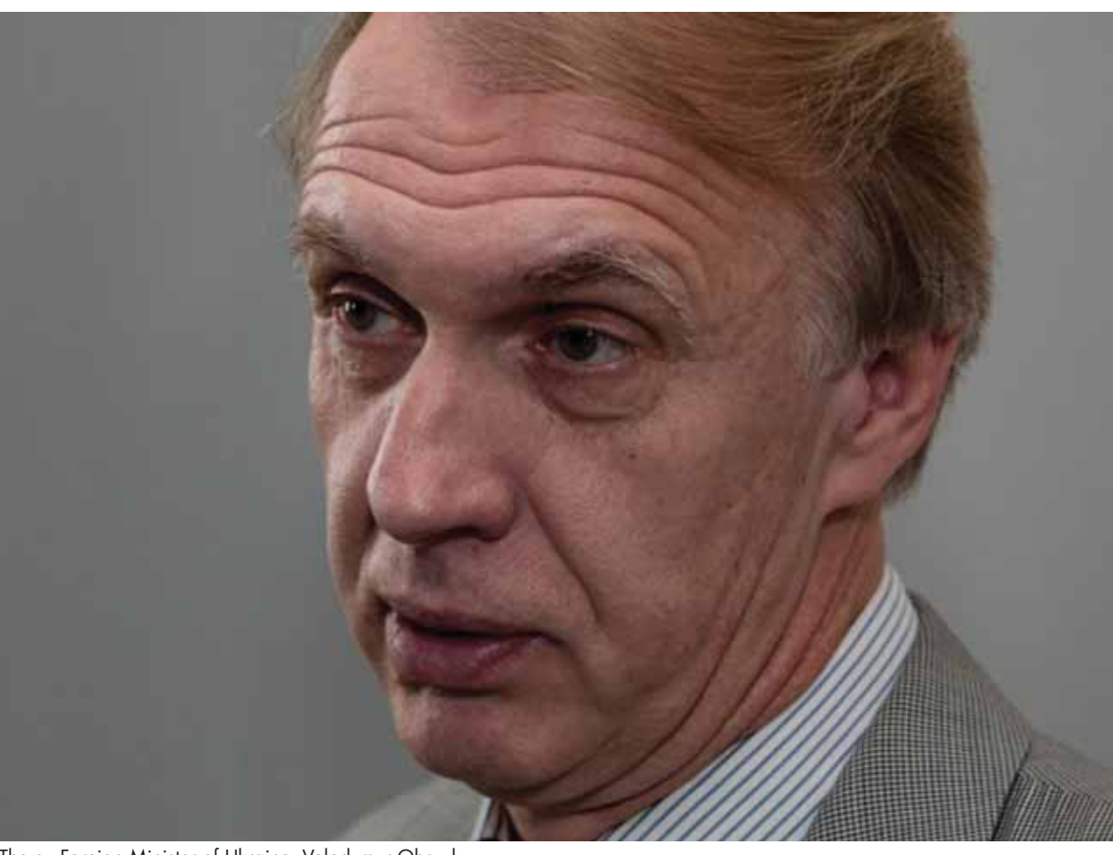
The ex Foreign Minister of Ukraine, Volodymyr Ohryzk

The anti-Americanism in France and Germany was and still is very high, despite the fact the Americans freed Europe from the Nazis, and later Germany from Soviet rule. And let's not forget that economic interests rule the game, and trading with Russia was something they were very fond of. Even now, after this huge invasion of Russia and