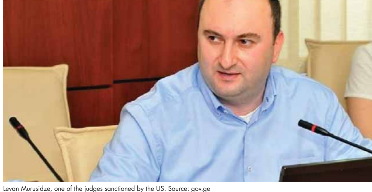
Levan Murusidze, one of the judges sanctioned by the US.

"Firstly, I would like to remind you of the most dire legacy inherited by the "Georgian Dream" in the judiciary in 2012 when it assumed power. The reality on the ground was indeed grave: the court system had effectively been incorporated into the prosecution as its subdivision, transforming it into another link in the repressive machine of the authoritarian regime in place at the time; over 99% of cases heard ended in convictions; more than 300 thousand citizens were tried in court; elite corruption was permeating the judiciary as well as other spheres, the authorities were committing systemic crime. Under the conditions of an unjust and repressive judiciary the prison population swelled to 25 thousand, while the practice of systemic torture and inhumane treatment towards those incarcerated became rampant. As a result, mortality rate among the incarcerated reached the unprecedented high levels. After the "Georgian Dream" assumed power, the number of prisoners decreased two and a half times. The