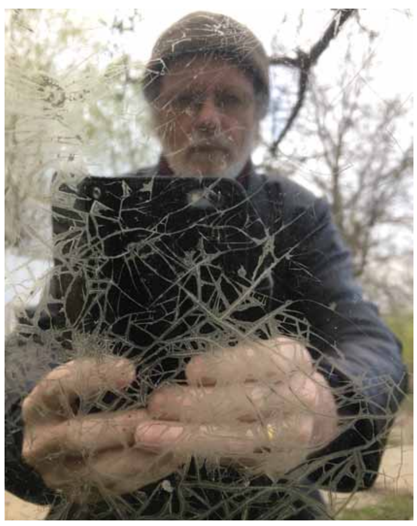
BLOG BY TONY HANMER

ve just been going through all my surviving original photographic material which was NOT among the stuff lost in our garage fire of January 2022 in Svaneti. Soon after the fire, I remembered a large plastic