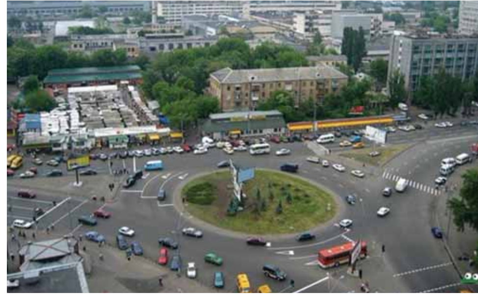
The breakdown of reconstruction in Kyiv puts Ukraine's relations with a key ally under attack

"Kyiv Terminal" paid more than $14 million