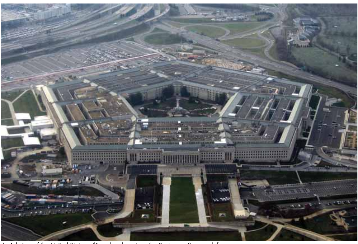
Aerial view of the United States military headquarters, the Pentagon.