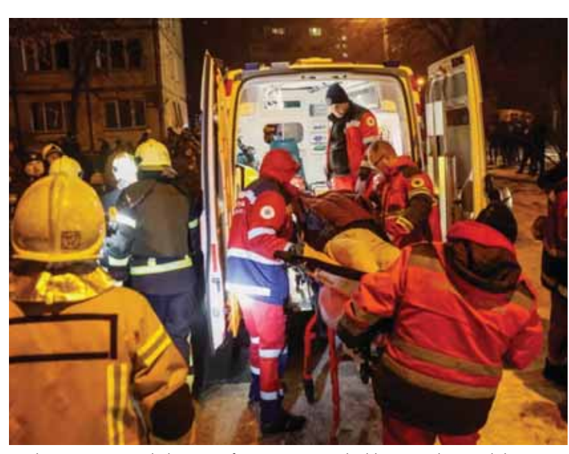
Medics carry a wounded person after an apartment building was damaged during a Russian missile strike in Kyiv.