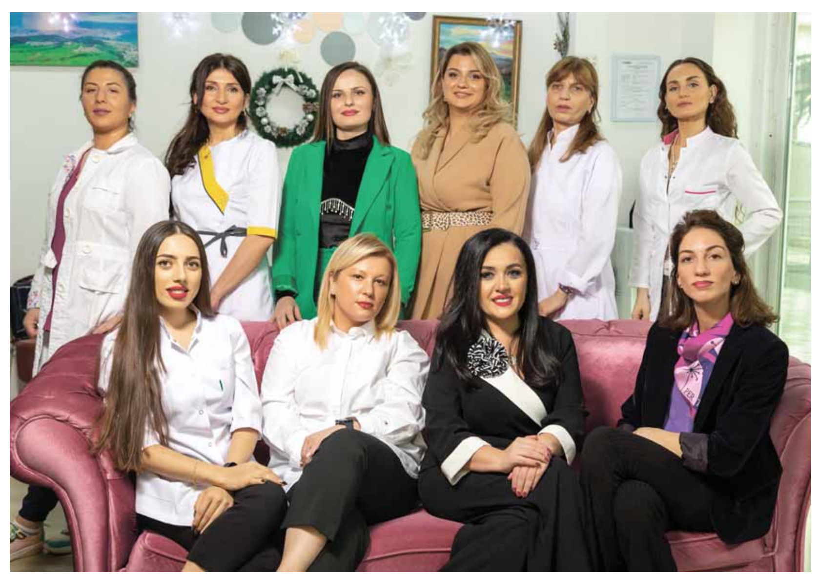
BY MARIAM MTIVLISHVILI

esthetic center Per Teturned two years old, and celebrated its anniversary with more employees and new offers for customers at the restaurant Emocia. Per Te continues to work on even more diverse offers and consumer packages for the public, and