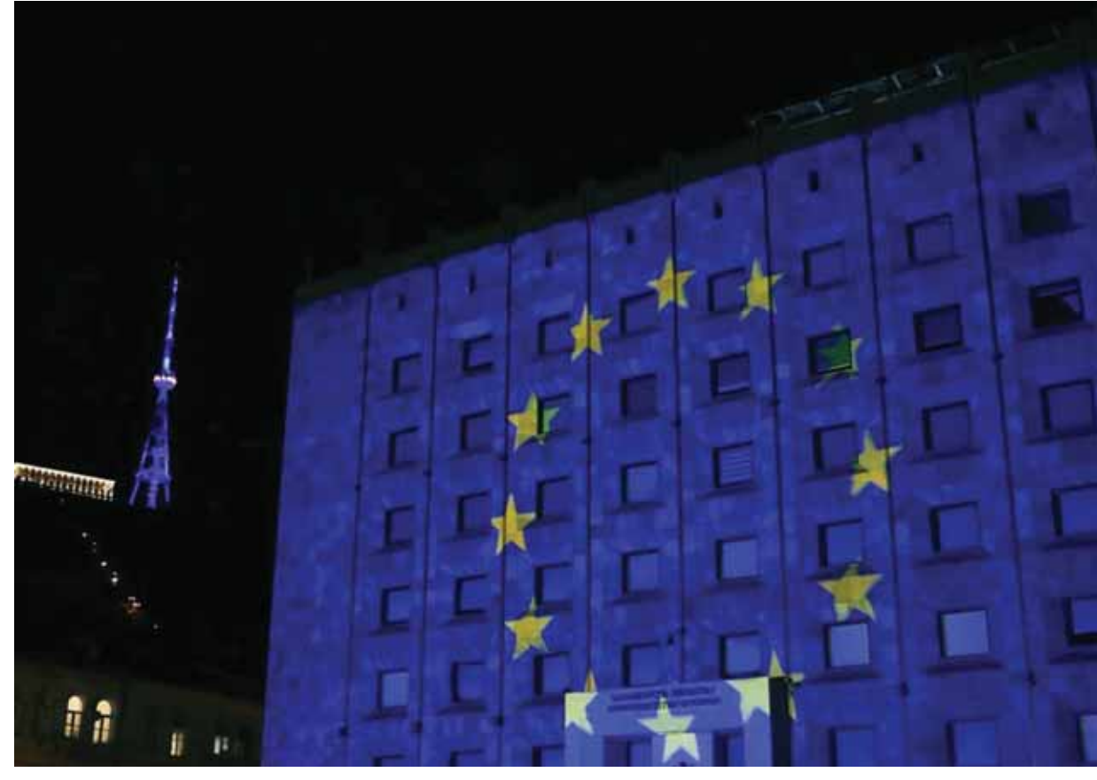
Georgia's Government Administration Building, illuminated in the colors of the EU flag.

Thus, the conclusion drawn from the Georgian end of the coherent European integration process is very likely that