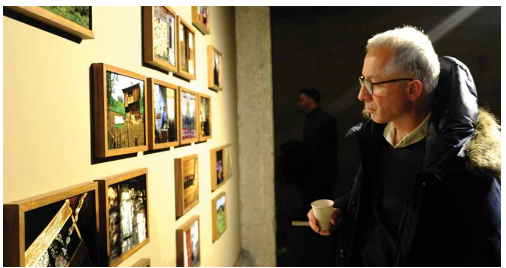
An attendee of the opening night of the exhibition examines one of the displays.