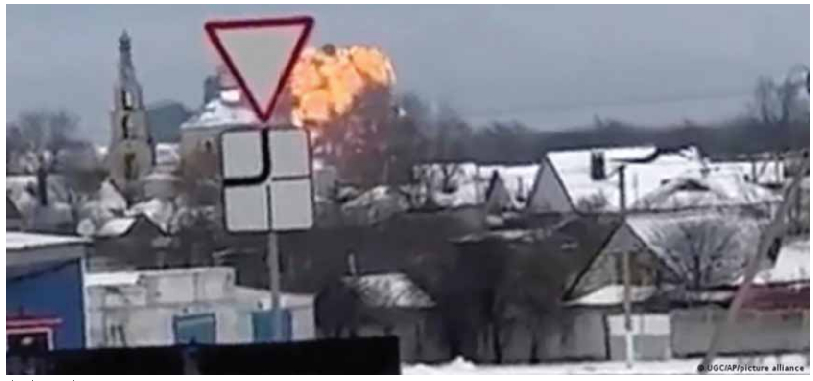
The plane crash.