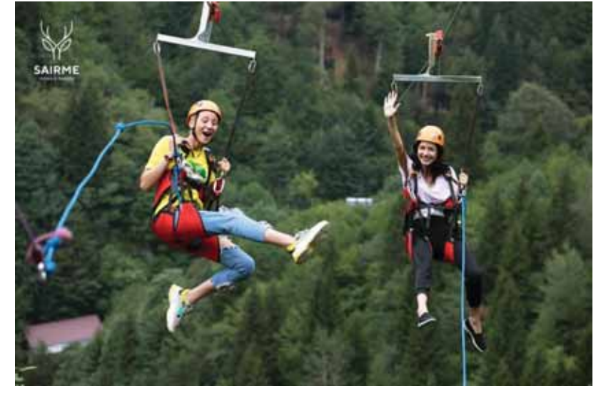
Continued from page 1

It is actually the biggest resort in all of Europe and Caucasus, with greenery spread over 60 hectares of land, and six different healing springs that can simultaneously cure 64 different illnesses. Sairme Resort has been renowned for decades, even though infrastructural development to accommodate modern tourists was only initiated in 2011.