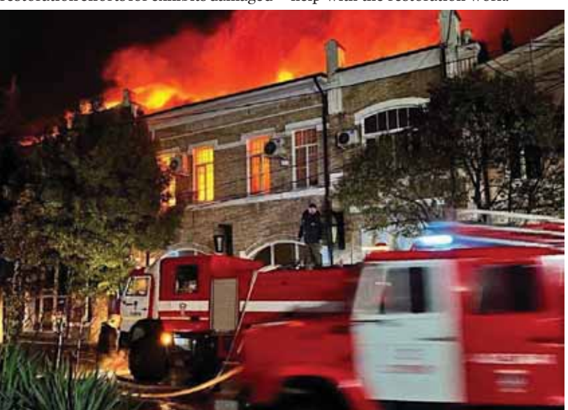
Fire crews fight to put out the burning artworks.

Getting there first, Olga Lyubimova, the Minister of Culture of the Russian Federation, said that the fire was a "real tragedy" and a "humanitarian disaster" for Abkhazia, and announced that Russia will be sending its own specialists to help with the restoration work.