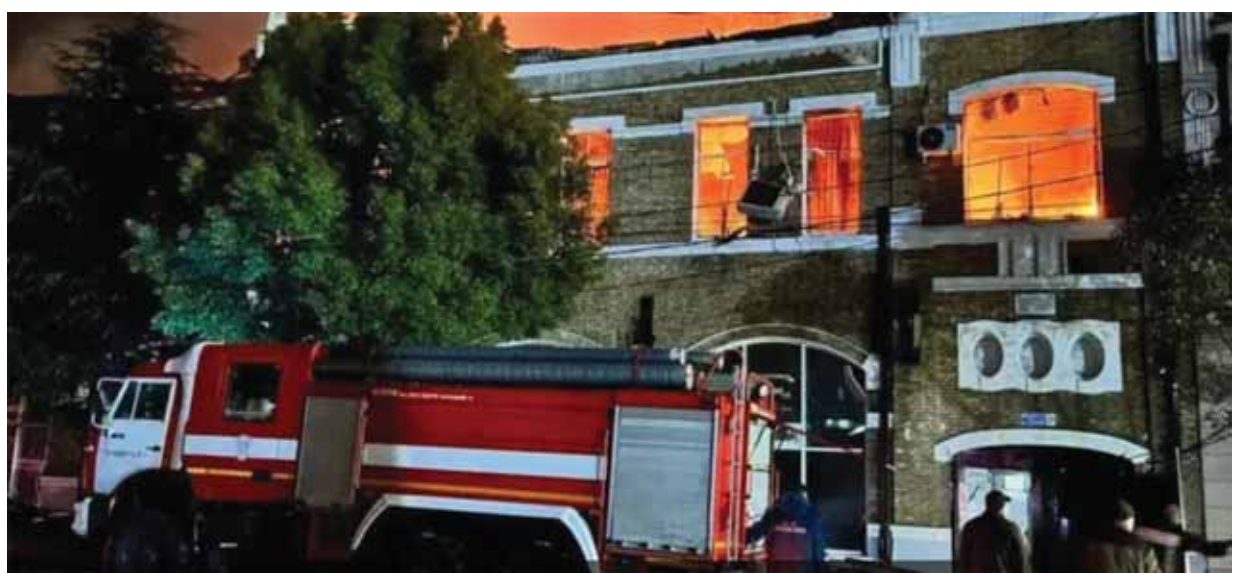
The blaze at the Sokhumi National Gallery.