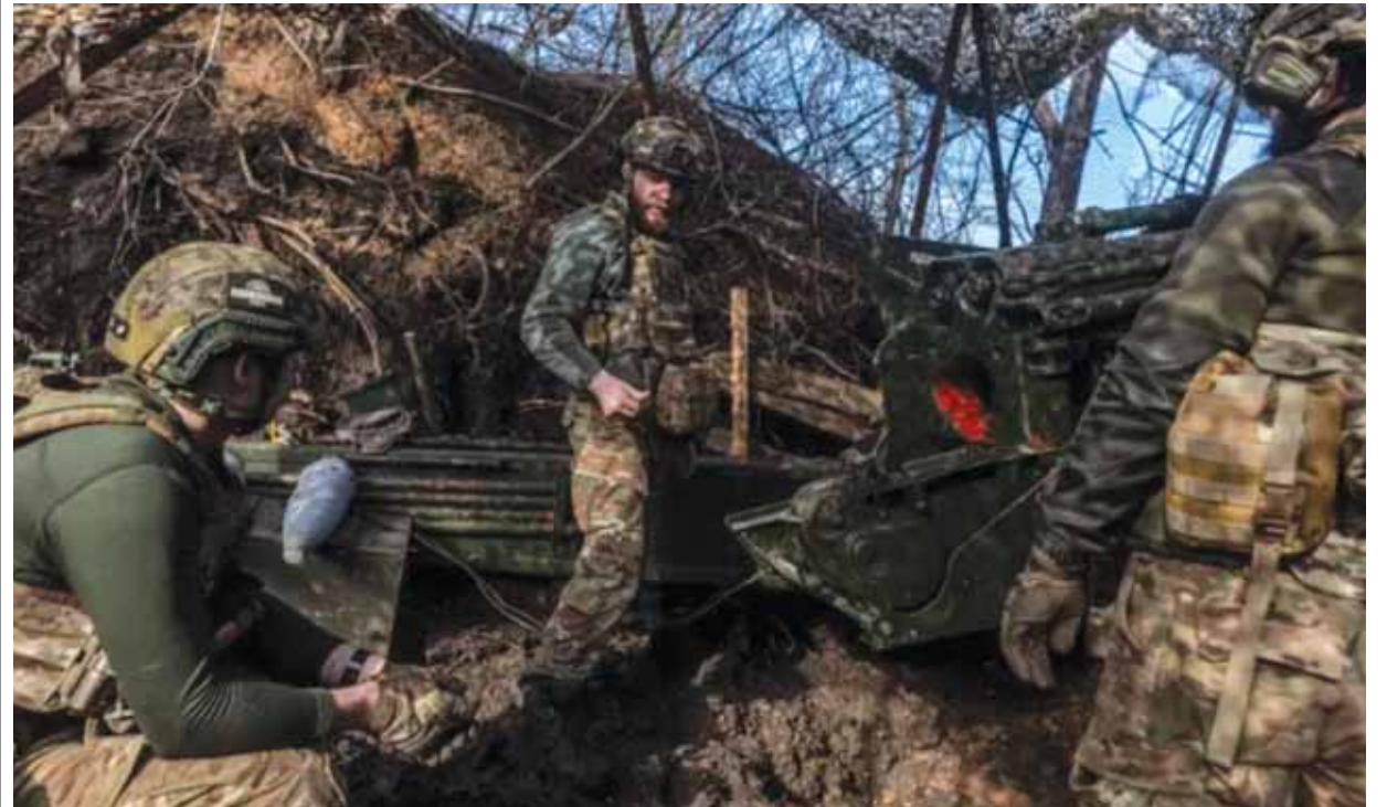
Ukrainian soldiers prepare Soviet-era artillery as Russia-Ukraine war continues in the direction of Kreminna, in Donetsk Oblast, Ukraine.