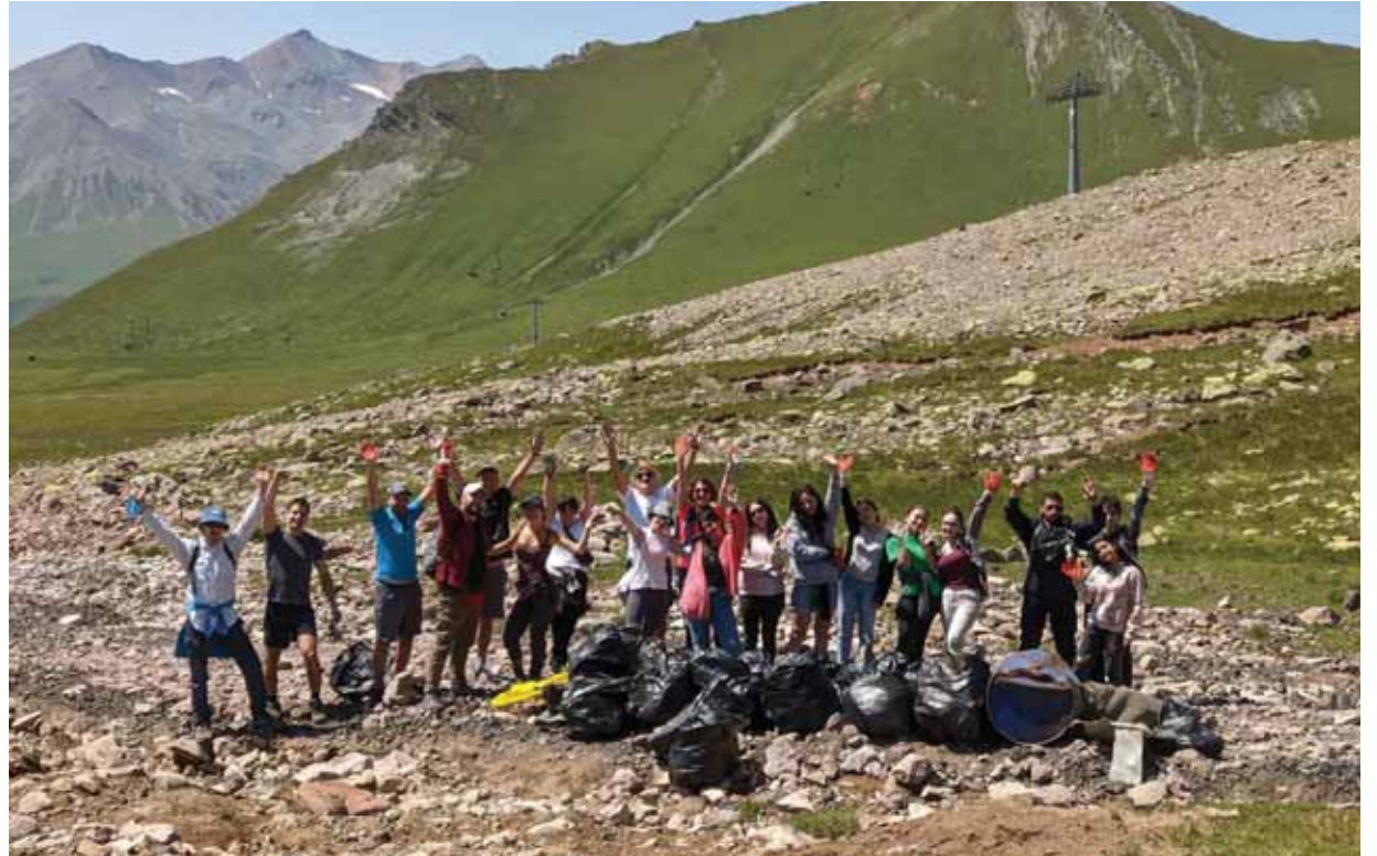
A Sadagi clean-up

Sadagi's purpose is to inspire and educate our citizens to turn Georgia into a clean, orderly and even more beautiful place - it's a colossal goal. To clarify our aspirations and measure progress, we developed a project named the Georgia Cleanness Index. As a manager and a citizen deeply committed to Sadagi's purpose, I realize that we need reliable short-term and long-term metrics of success for the team and for our citizens. Visible signs of progress are immensely motivating. Painful facts about the extent of pollution and also occasional failures, which inevitably happen, if treated