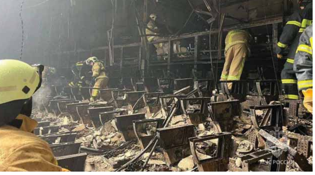
Russian emergency services sift through the burnt wreckage of the entertainment center.

With target intelligence data flowing from various sources, they absolutely must be assessed and categorized regardless of the source of the information. In this situation, the timeless adage of "the enemy of my enemy is my friend" could have saved lives, and enhanced the response of law enforcement. An unbiased filtration of incoming intelligence is key to correctly categorizing threats. With hindsight, it's difficult to firmly state if these would have stopped or curtailed the gunmen in Moscow outright beforehand. However, there is no doubt that it would have created a more positive security situation and facilitated the elimination of the threat either during or shortly after the event. For professional defense, security, and law enforcement officials, this acts as a sad reminder of the importance of readiness, the fight against complacency, and positioning of resources in an age that faces threats from multiple sources.