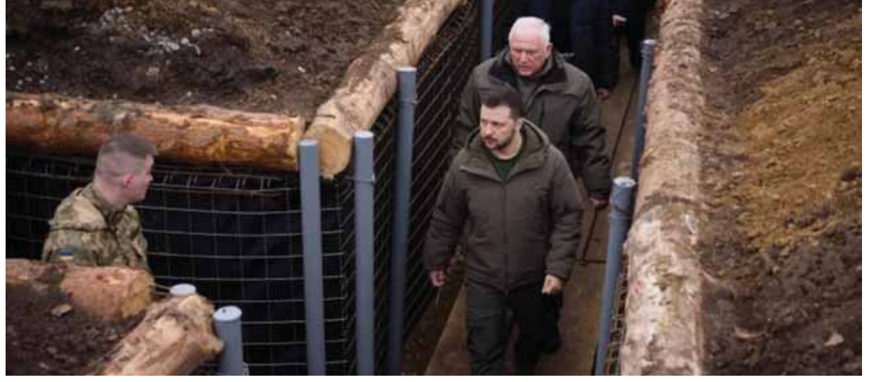
Ukrainian President Volodymyr Zelenskyy inspected newly-built defences in the Sumy region.

Ukraine has strongly denied having any involvement in the attack. On March 7, the United States issued a warning of