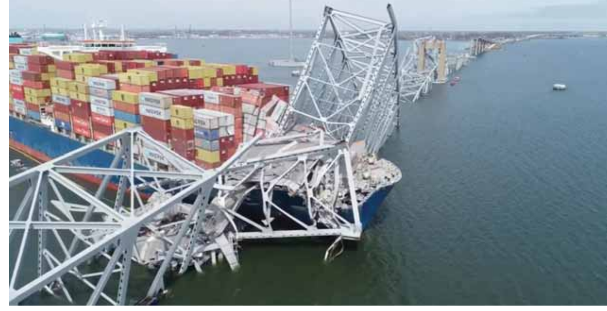
The Singapore-flagged container vessel named Dali, heading out of Baltimore Harbor bound for Sri Lanka, lost power and plowed into the Francis Scott Key Bridge at about 1.30am on Tuesday. Six workers were killed.

All the resulting fuss and investigative efforts seem awfully miserable against the backdrop of the hurt human imagination and broken hearts. As an old Baltimorean from the famously quaint Fells