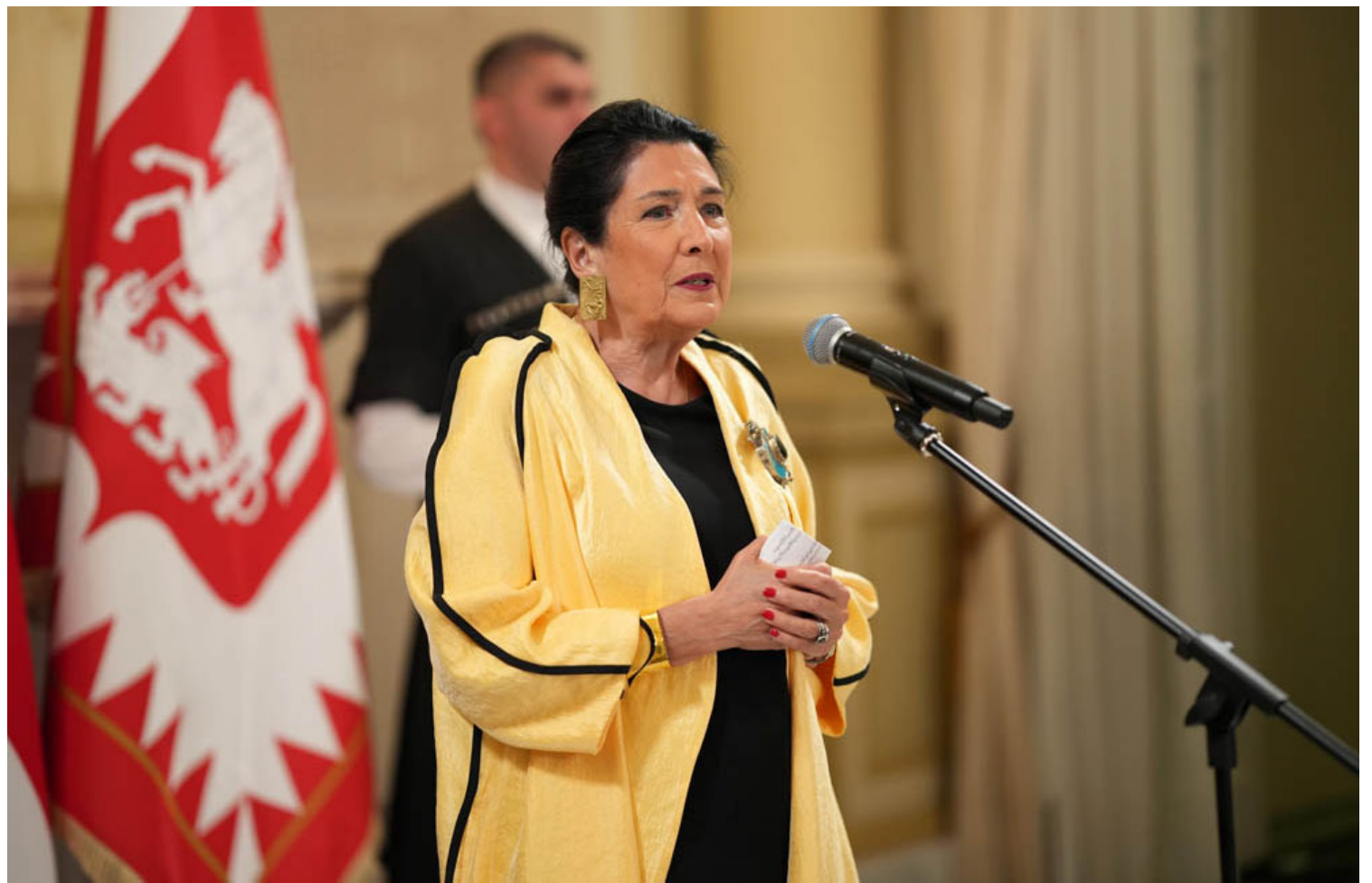
By Liza Mchedlidze

In a joint press conference following his meeting with Prime Minister Irakli Kobakhidze, German Chancellor Olaf Scholz sharply criticized the controversial 'Russian law' proposed by the